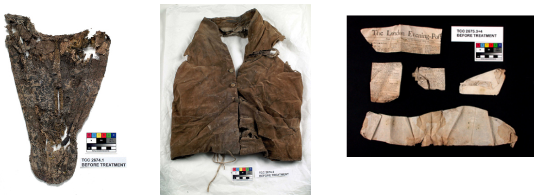
The Nether Wallop cache: 18thC stomacher, early 19thC waistcoat, paper patterns

1. Raise awareness of finds and their significance via the identification and recording of finds; via publications, lectures, web-mailings, site visits, media interviews and a touring exhibition called ' Hidden House History '. See Attachment 1 below with data about website visits, mailings, etc.