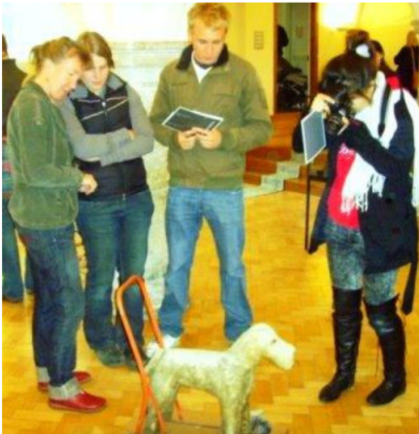
Visitors with Sandy – the dog