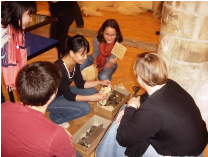
Exhibition set-up: Museum objects and MA students