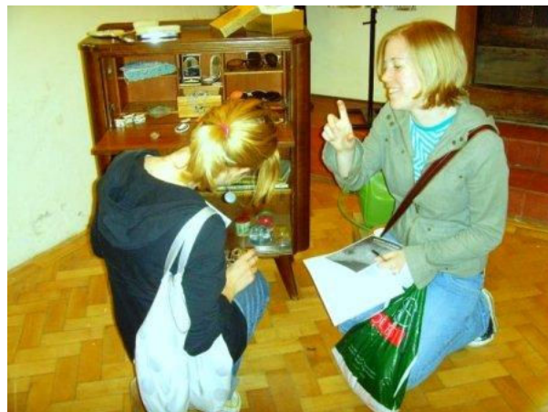
Exhibition visitors looking at found objects display