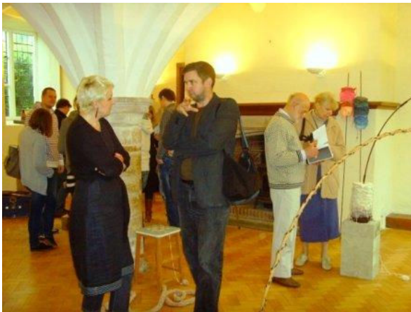
Artist with visitor